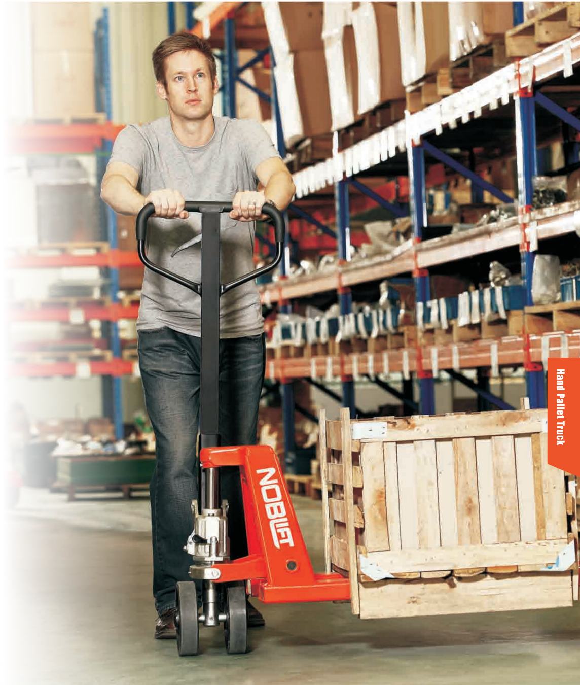
Hand Pallet Truck